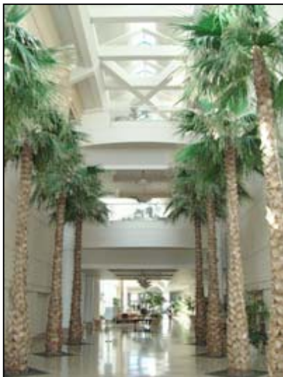
The lobby at UCSD's La Jolla hospital

The $350 - $450 million addition to the hospital